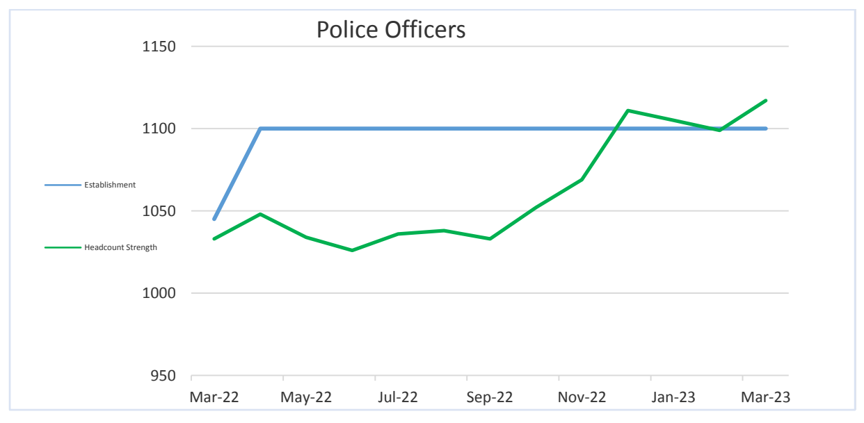
Graph 1 - Police Officer Establishment

I am pleased to be able to report that this ambition continues to be progressed, where in May 2022 the number of police officers stands at a head count of 1,034. This number is projected to further increase through the Governments 'Uplift 'programme of police officer recruitment to achieve a force establishment of 1,100 officers during 2022/23, as the following graph illustrates: -